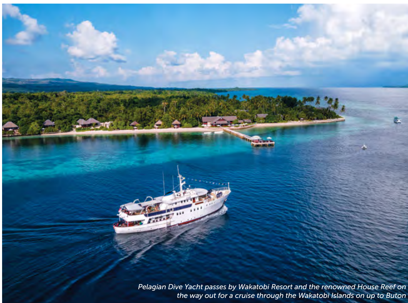
Pelagian Dive Yacht passes by Wakatobi Resort and the renowned House Reef on the way out for a cruise through the Wakatobi Islands on up to Buton

W akatobi Resort is renowned for world-class diving and snorkeling. Set on a small, picturesque island in Southeast Sulawesi, Indonesia, the boutique beachfront resort offers immediate access to one of the most bio-diverse coral reef environments on our planet. Surrounding waters present an unmatched wealth of marine life along with compelling underwater landscapes. Here's seven favourite Wakatobi sites to showcase the amazing diversity here on offer for divers.