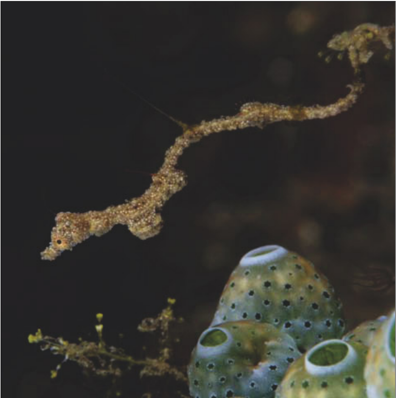
Fig. 2. Kyonemichthys rumengani n. sp., holotype, female, Lembah Straits, Sulawesi, Indonesia, in life.

length of the ventrally expanded portion of the trunk 44.7% of preanal length; tail depth at TAR1 2.2% TL; superior body ridge and inferior tail ridge distinct, ridges on each ring slightly elevated posteriorly, forming a low bump, those on first, fourth, eighth, fourteenth, eighteenth, twentieth, twenty-fourth and twenty-eighth superior body ridges noticeably enlarged, the third (STR8), fourth (STAR5) and seventh (STAR15) of these greatly so, those on STR8 and STAR5 with a ver-